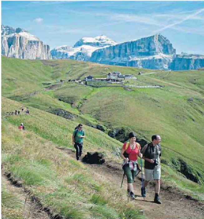
▲ 'Natural playground': go trekking in the Val di Fassa and recover with a spa treatment

Tucked in the Val di Fassa, Canazei is a natural playground. It has just become quicker to access, thanks to SkyAlps' new twice-weekly spring/summer Gatwick-Bolzano flights (skyalps.com). Also, from May to October, 35 lifts operate in the valley, whisking hikers up to meadows and mountains – walking options range from family strolls to hut-to-hut Trek-King routes right round the Fassa Dolomites. Road cyclists can try Giro d'Italia climbs or, less strenuous, the Fiemme & Fassa ride along the Avisio River. Canazei is also a wonderful spot for wellness, including yoga, barefoot paths and forest bathing. Ancient Roman-inspired spa-ing at Eghes Wellness (dolaondes.it) or dipping in Trentino's only sulphur spring at QC Terme Dolomiti (qcterme.com).