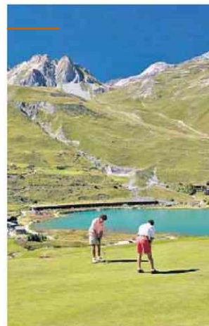
▲ Tignes: play 'the highest golf in Europe'