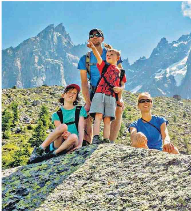
▲ Kidding around: Vaujany holds a ‘Family Plus’ label – awarded to child-friendly resorts