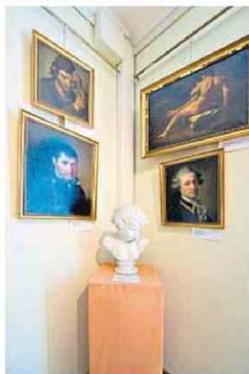
▲ In the frame: the Rossetti Valentini Fine Art School in Santa Maria Maggiore

lagomaggiorexperience.it ; visitpiemonte.com