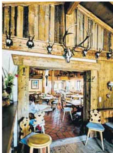
▲ Old school: Restaurant S'Pfundlundaue