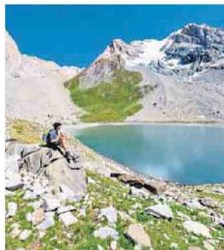
▲ Explore the glaciers and lakes of Pralognan

Pralognan-la-Vanoise, below the highest peak in Vanoise National Park, is one of the original homes of mountaineering. Awarded the Terre d'Alpinisme label in 2022 – given to destinations that defend the Unesco-listed Intangible Cultural Heritage of mountaineering – Pralognan continues to draw those who love high places. There are 35 hiking and mountain guides here (guides-pralognan.com). New excursions for 2024 include an icy glacier trip, a hiking tour to the wildest peaks, and à la carte journeys, ranging from two to eight days, sleeping in mountain huts. Of course, you can hit the 250km of hiking trails alone; there are also chances to try climbing, paragliding, mountain-biking, trail running, via ferrata and more.