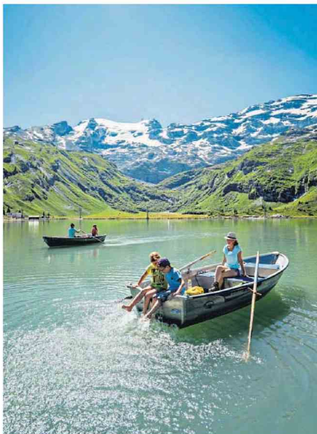
▲ Oarsome: Engelberg has a 'distinctly sporty vibe' but also a reputation for art and food